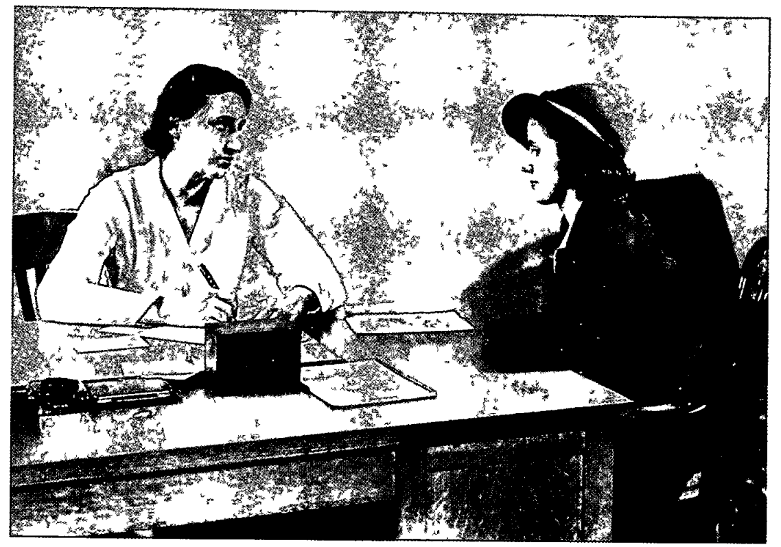
from the film 'Why Let Them Die!'