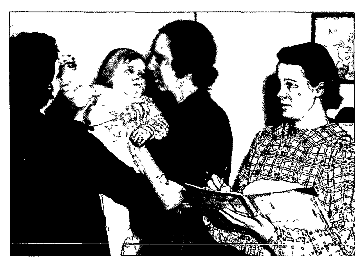
Babies are frequent visitors at the Maternal Health Center in Oklahoma Caty Here a patient (left) leaves her baby in the care of the social worker as the care history is taken Since it opened in June, 1937, the center har had 664 new patients, 446 of whom were mothers of families supported entirely or partly by relief funds. The average number of living children per patient was three

The Federation has become an Institutional Member of the National Conference of Social Work, to be held in Buffalo next June, and will have a booth and conduct sessions at the Conference