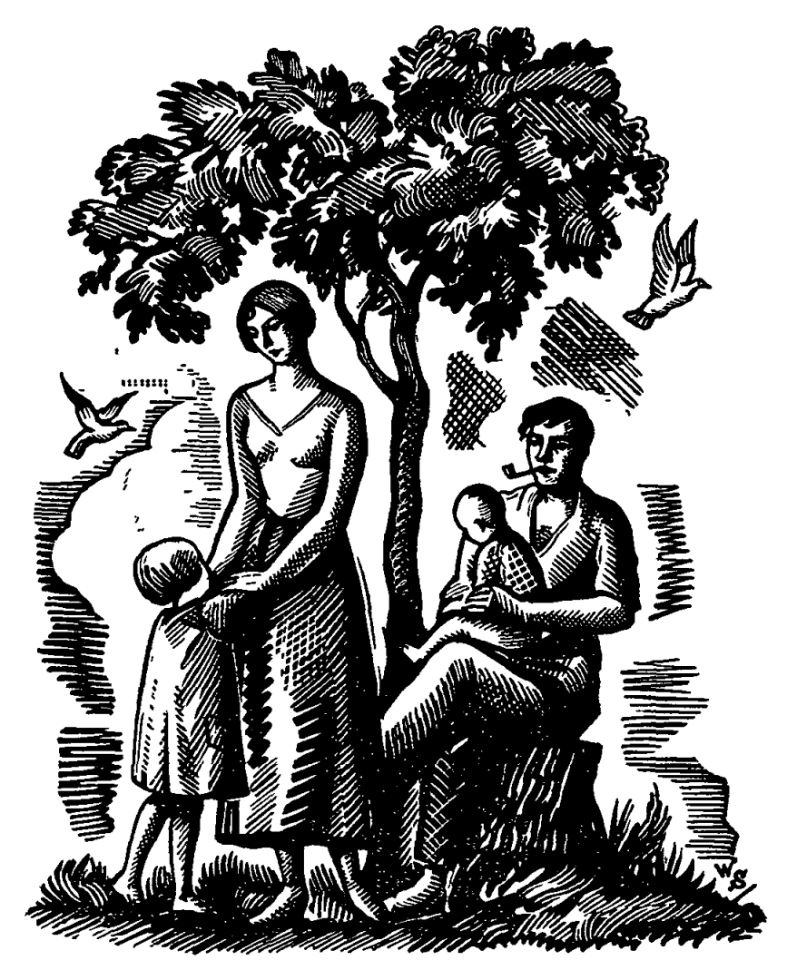
DRAWING BY WILLIAM SIEGEL