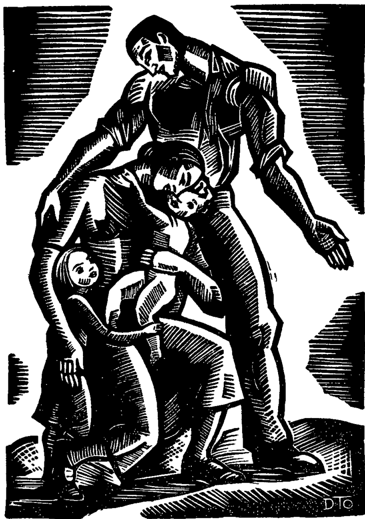
Woodcut by Dorothy Owen