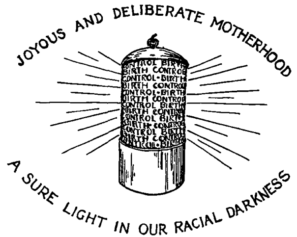
Emblem of the English Society for Constructive Birth Control