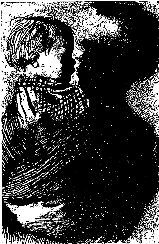
MOTHER AND CHILD