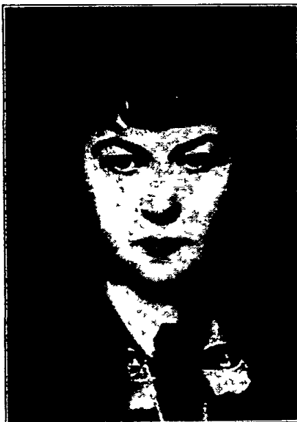
MME ALEXANDRA KOLLONTAY who has written a fascinating, challenging book that you must read

In this moving and important volume a great apostle of feminine freedom pictures the soul struggles of the "free women" of Russia