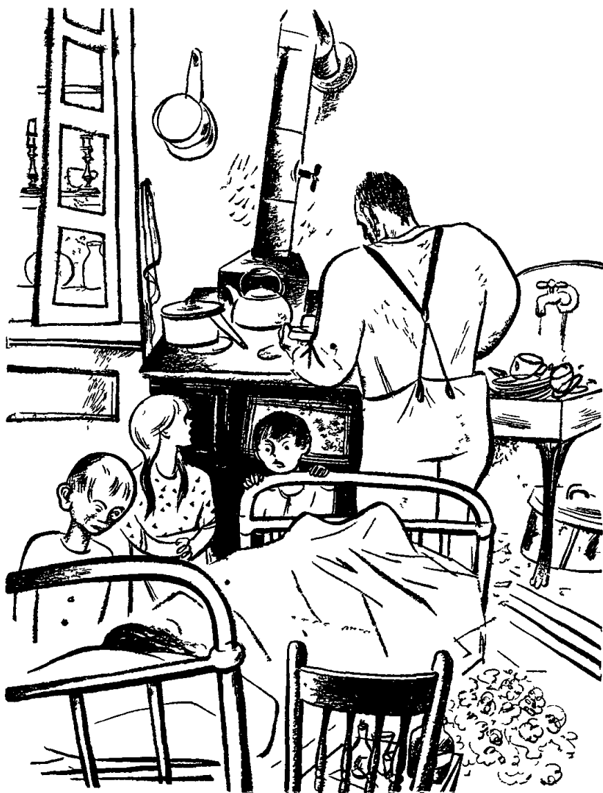
ANOTHER KID, By WILLIAM GROPPER