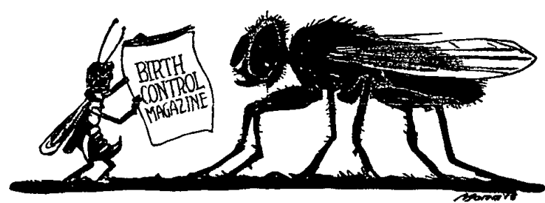
"Here y'are, Mrs Housefly, latest copy"

The Court I find the defendant Not Guilty Discharged