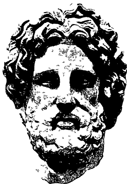
Aesculapius God of Health