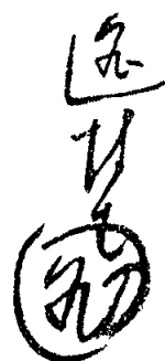
A KOREAN FATHER