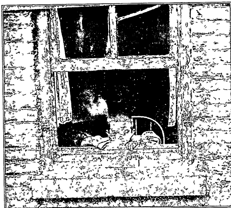
Left at Home While the Mother Goes to Work

The Lonely Child Develops Neither Mentally Nor Physically