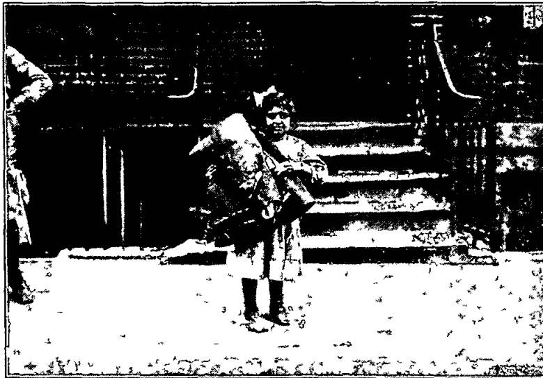
No Time to Play—Fetching Home Work After School

Child Labor Brings Down the Father's Wages