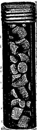
Medicated Cartridges (patented)

Stop suffering. Try this new invention which has already proven successful in thousands of cases. Remember you take absolutely no risk. Mail the coupon NOW and in a few days you will write us as nice a letter as you will find in the panel at the right. Mail the coupon before you forget. Don't let delay rob you of the relief Breathe O Tol brings.