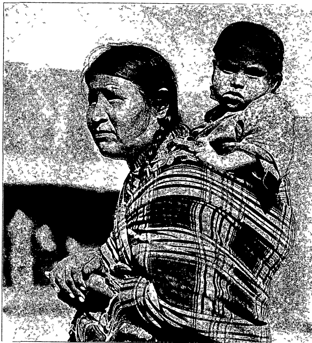
A REAL AMERICAN MOTHER—SIOUX INDIAN