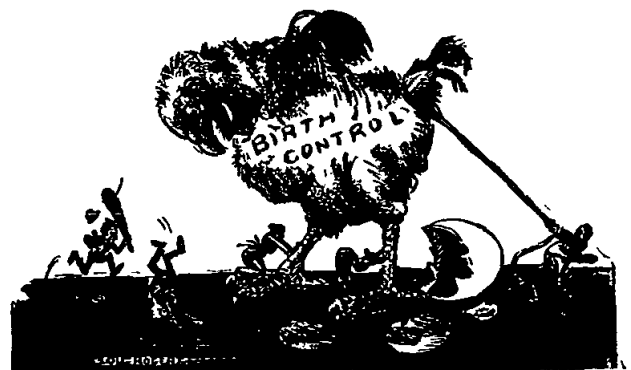
PUTTING THE CHICKEN BACK INTO THE SHELL

This can be done by establishing schools for lads and girls, husbands and wives, fathers and mothers throughout the land. No end of ways suggest themselves as to how this may be done, the National Congress of Mothers and Parent-Teacher Associations is one far-reaching power for good